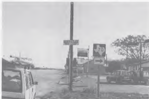
ANSWER to question on Page Seven: It's the Texas town of Sandia, north of Corpus Christi. "Three houses, a community center, and a gas station,".